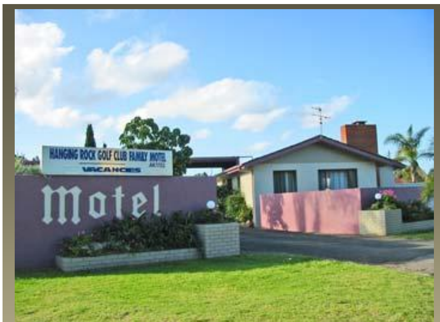
HANGING ROCK FAMILY MOTEL

Both crew members and a member of the service crew are required to attend.